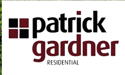
Harmony Nook, Eastwick Road, Great Bookham, Surrey, KT23 4BJ